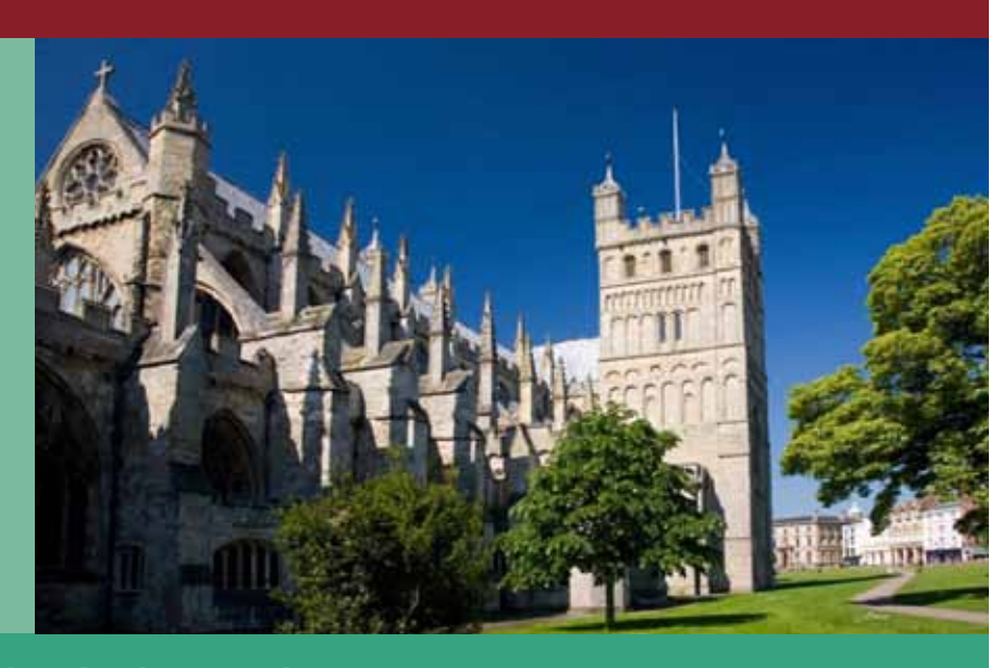
Exeter Cathedral • www.exeter-cathedral.org.uk

One of the finest examples of Decorated Gothic architecture in England