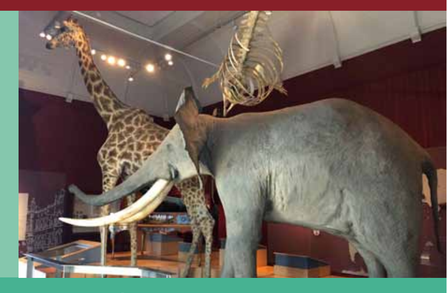
Royal Albert Memorial Museum • www.exeter.gov.uk/ramm

A voyage of discovery from Exeter and all around the world